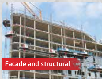
Facade and structural